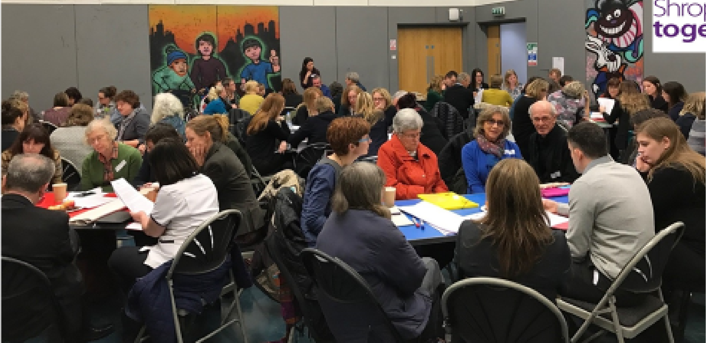
Social Prescribing Update